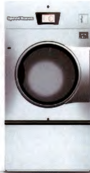
SINGLE TUMBLE DRYERS