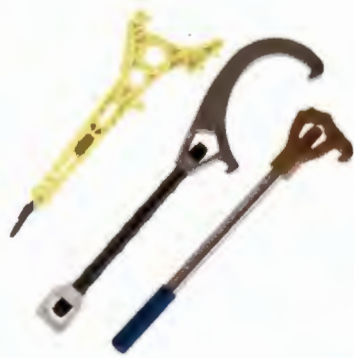
Fire Hydrant Wrenches