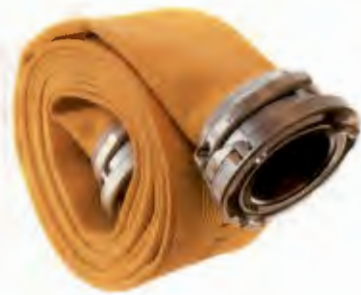
Storz Supply Hose