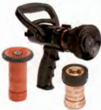
1" Hose Nozzles