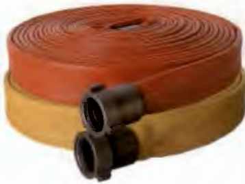
Rubber Covered Hose