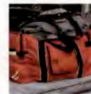
Turnout Gear Bags and Mask Bags