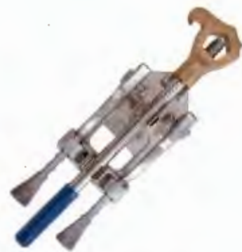
Wrench Holder Sets