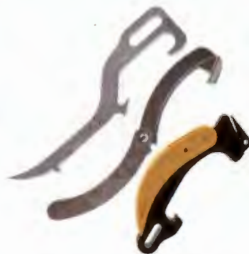
Fire Hose Spanner Wrenches