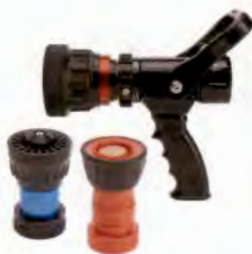
1 1/2" Hose Nozzles