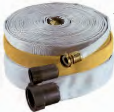
Forestry / Wildland Hose