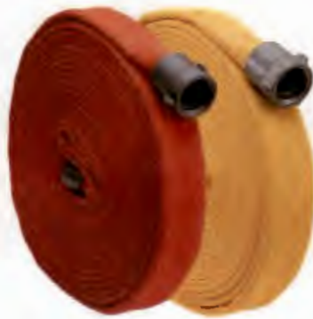
Double Jacket Fire Hose