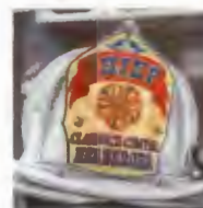
Gold Leaf Shields