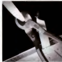
Channellock Tool Engraving