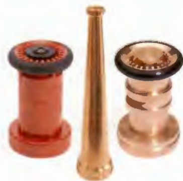
2" Hose Nozzles