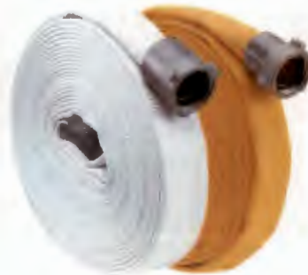
Single Jacket Fire Hose