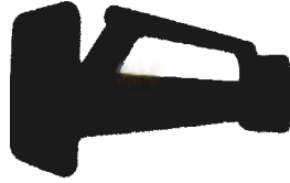
Forcible Entry Tools