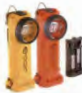
Right Angle Lights