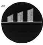
Exhibit 2: Silver Star Layout