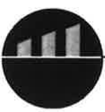
Exhibit 1: Estimated Value Schedule of Property